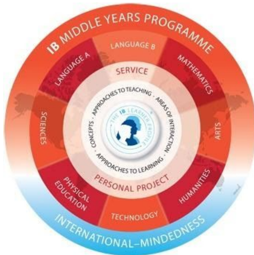
Figure 1 The programme

The MYP is designed for students aged 11 to 16. The MYP has been devised to guide students in their search for a sense of belonging in the world around them. It also aims to help students to develop the knowledge, attitudes and skills they need to participate actively and responsibly in a changing and increasingly interrelated world. This means teaching them to become more independent learners who can recognize relationships between school subjects and the world outside, and learn to combine relevant knowledge, experience and critical thinking to solve authentic problems.